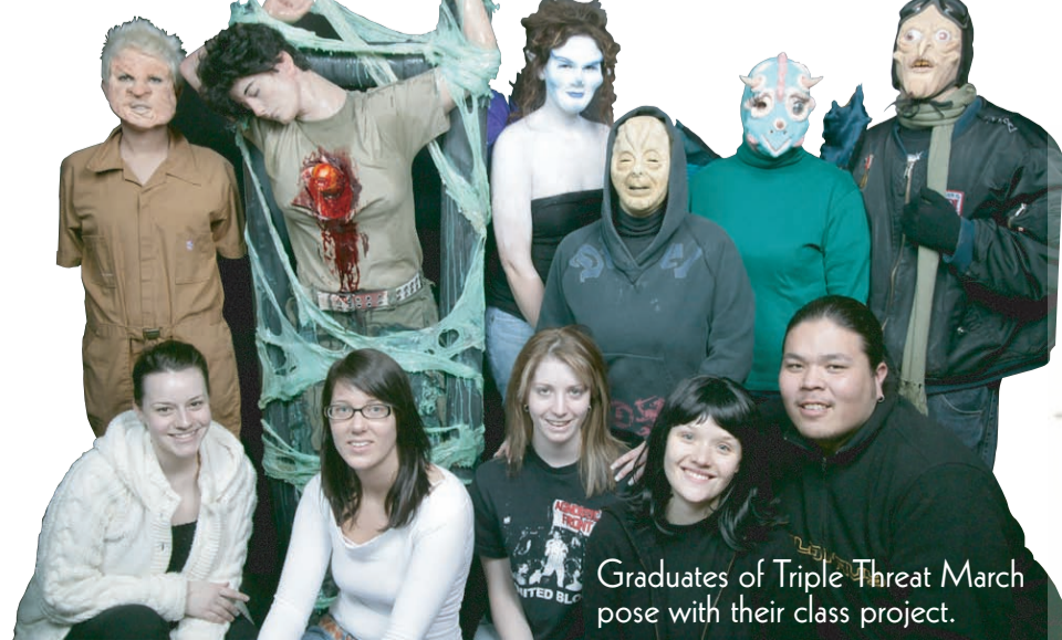
Graduates of Triple Threat March pose with their class project.

The School of Professional Makeup is proud to have formed an alliance with the Toronto Film College . Our students will have the privilege of collaborating with TFC students on projects that will be broadcast on the cable television channel Movieola. TFC offers courses in cinematography, audio and visual editing, documentary filmmaking, to name just a few, as well as a variety of workshop options. The only factor seemingly left out of their all-encompassing curriculum is the importance of makeup of film—which is where we come in! School of Pro Makeup students will have ongoing opportunities to perform natural film makeups, hair works, special fx and prosthetics for a variety of student film projects.